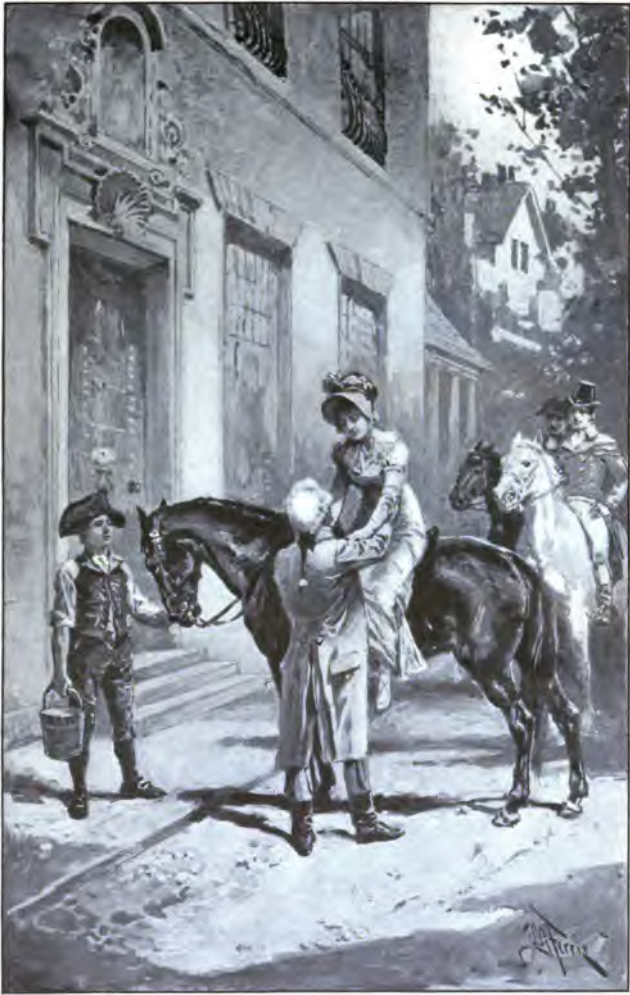
GENERAL ROCHAMBEAU AND DOROTHEA.